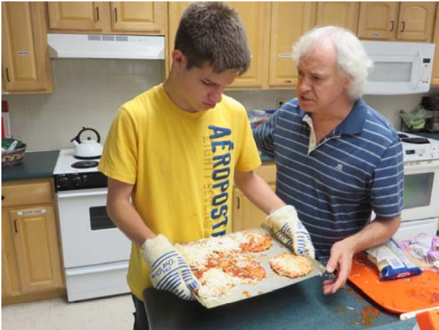
A PPLI intern works with a consumer on independent living skills

Helen Keller National Center for Deaf-Blind Youths and Adults 141 Middle Neck Road Sands Point, NY 11050 V: 516-944-8900 VP: 516-570-3635 www.hknc.org