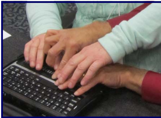
A braille notetaker - adaptive technology

The Professional Learning and Leadership Institute is an internship program available to individuals with a combined vision and hearing loss. They must be currently unemployed or underemployed and seeking employment in the rehabilitation field working with individuals who are deaf-blind. This program embraces the philosophies of self-leadership, self-employment and peer collaborative learning. Interns will have the chance to gain skills and experiences to support their goal to become an instructor, trainer or habilitation specialist. Opportunities are available in various rehabilitation areas such as independent living, communication, braille, adaptive technology, vocational development, residential habilitation, advocacy and other related fields. The expected outcome after the internship is successful employment in the blind or deaf-blind rehabilitation field. The intentions of this internship program are two-fold. It is an employment program for deaf-blind individuals. It also promotes peer to peer instruction, training and engagement of deaf-blind leaders in the deaf-blind rehabilitation field.