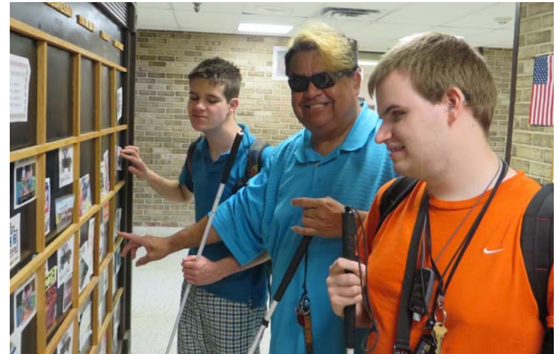
A PLLI intern works with two consumers in residential habilitation